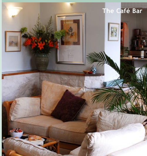
The Café Bar

Our New England style Café Bar enjoys sunshine in the afternoons and is a popular place with guests and locals alike for snacks, coffees, light meals or cocktails. Enjoy them in the bar, by the pool or on the terrace looking out over the wonderful Char Valley view.